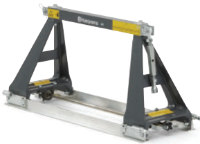
HUSQVARNA SV SCREED SECTION 967 95 59-03