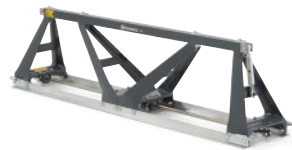
HUSQVARNA SV SCREED SECTION 967 95 59-04