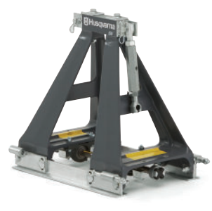
HUSQVARNA SV SCREED SECTION 967 95 59-02