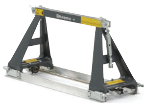
HUSQVARNA SV SCREED SECTION 967 95 59-03