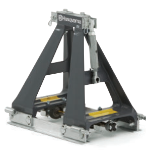
HUSQVARNA SV SCREED SECTION 967 95 59-01