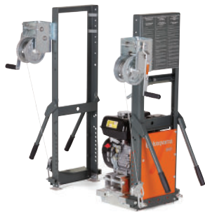
HUSQVARNA SVG 967 95 58-01