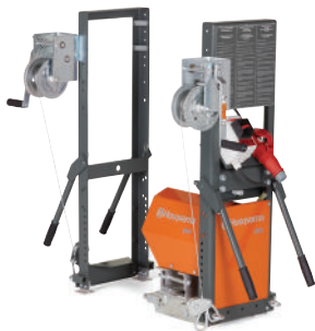
HUSQVARNA SVE 967 95 57-01