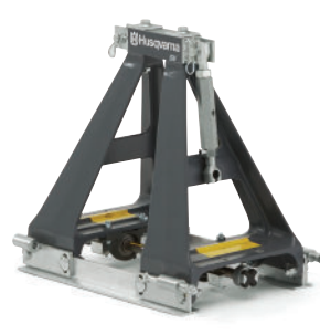
HUSQVARNA SV SCREED SECTION 967 95 59-02