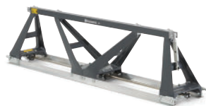
HUSQVARNA SV SCREED SECTION 967 95 59-04