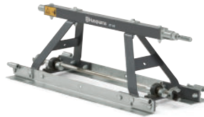
HUSQVARNA BT 90 PETROL/ ELECTRIC SCREED SECTION 967 94 11-05