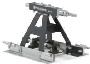
HUSQVARNA BT 90 PETROL/ ELECTRIC SCREED SECTION 967 94 11-16