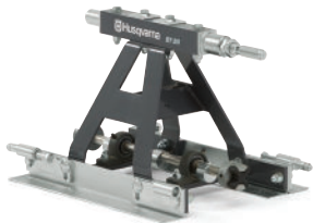
HUSQVARNA BT 90 PETROL/ ELECTRIC SCREED SECTION 967 94 11-04