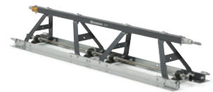
HUSQVARNA BT 90 PETROL/ ELECTRIC SCREED SECTION 967 94 11-06