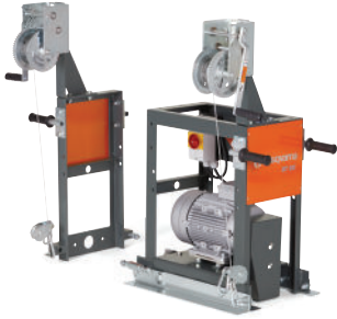
HUSQVARNA BT 90 ELECTRIC 967 94 11-02