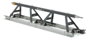
HUSQVARNA BT 90 PETROL/ ELECTRIC SCREED SECTION 967 94 11-06