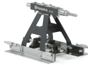
HUSQVARNA BT 90 PETROL/ ELECTRIC SCREED SECTION 967 94 11-04