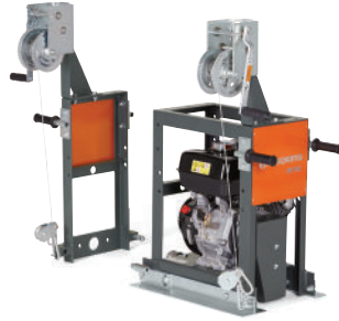
HUSQVARNA BT 90 PETROL 967 94 11-03