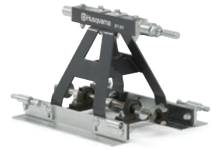
HUSQVARNA BT 90 PETROL/ ELECTRIC SCREED SECTION 967 94 11-16