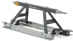
HUSQVARNA BT 90 PETROL/ ELECTRIC SCREED SECTION 967 94 11-05