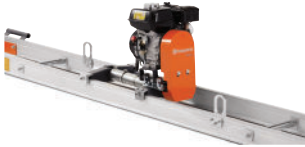
HUSQVARNA BE 30 967 94 12-02