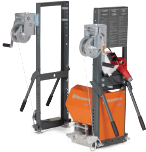
HUSQVARNA SVE 967 95 57-01