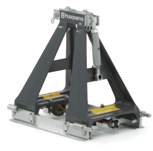
HUSQVARNA SV SCREED SECTION 967 95 59-02