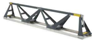
HUSQVARNA SV SCREED SECTION 967 95 59-05