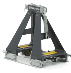
HUSQVARNA SV SCREED SECTION 967 95 59-01