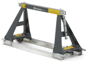
HUSQVARNA SV SCREED SECTION 967 95 59-03