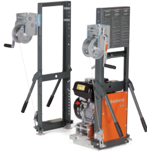
HUSQVARNA SVG 967 95 58-01