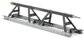
HUSQVARNA BT 90 PETROL/ ELECTRIC SCREED SECTION 967 94 11-06