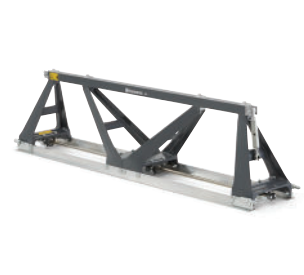
HUSQVARNA SV SCREED SECTION 967 95 59-04