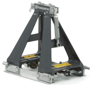
HUSQVARNA SV SCREED SECTION 967 95 59-02