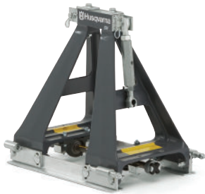
HUSQVARNA SV SCREED SECTION 967 95 59-01