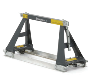
HUSQVARNA SV SCREED SECTION 967 95 59-03