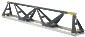
HUSQVARNA SV SCREED SECTION 967 95 59-05