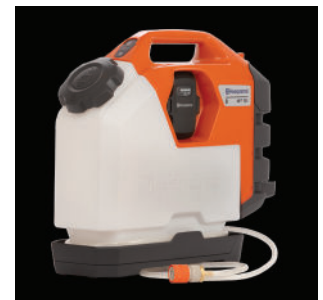
HUSQVARNA WT 15I 599 58 23-01