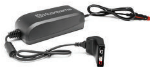
HUSQVARNA CHARGER QC80F 967 96 48-01