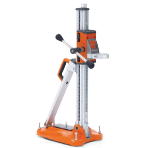
HUSQVARNA DS 150 966 82 72-01