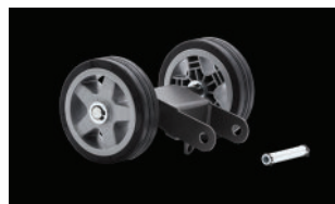
WHEELBASE DS 250 / 150 541 40 50-89