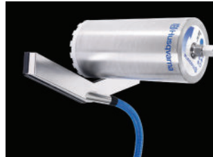
SLURRY COLLECTOR V-SHAPED 531 07 46-22