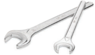
DRILL MOTOR KEYS 531 14 09-51