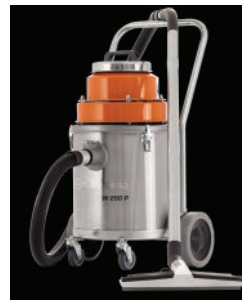
HUSQVARNA W 250 P 967 70 21-02