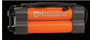
HUSQVARNA WT2GO 598 74 24-01