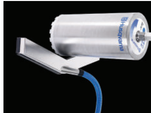
SLURRY COLLECTOR V-SHAPED 531 28 00-07