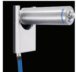
SLURRY COLLECTOR 531 28 03-29