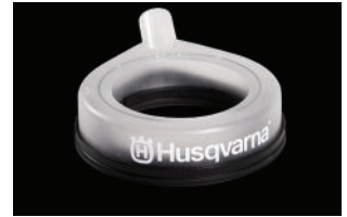
SLURRY RINGS WSR 593 56 30-01