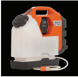
HUSQVARNA WT 15I 599 58 23-02