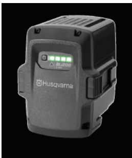
HUSQVARNA BATTERY BLI200 967 96 41-01