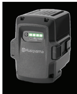
HUSQVARNA BATTERY BLI100 967 96 39-01