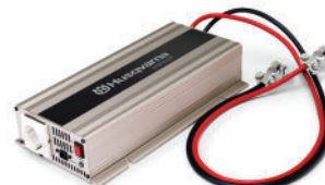
HUSQVARNA INVERTER VI600F 967 96 51-01