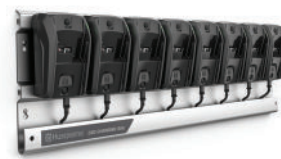
HUSQVARNA 40-C80 CHARGING RAIL STATION 970 70 05-01