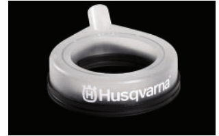
SLURRY RINGS WSR 593 56 30-05