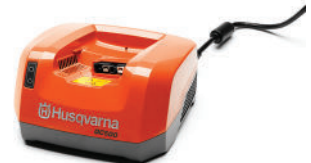
HUSQVARNA CHARGER QC500 967 96 50-01