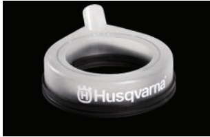
SLURRY RINGS WSR 593 56 30-02