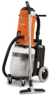
HUSQVARNA S 13 967 66 40-04