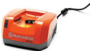
HUSQVARNA CHARGER QC330 967 96 49-01