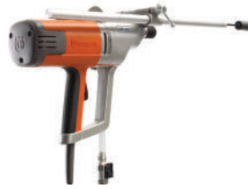
TELESCOPIC START HELP DEVICE 522 92 95-01