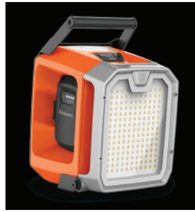
HUSQVARNA WL 81 970 58 49-01