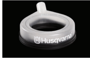
SLURRY RINGS WSR 593 56 30-03