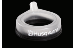
SLURRY RINGS WSR 593 56 30-04