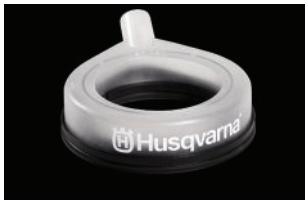
SLURRY RINGS WSR 593 56 30-06