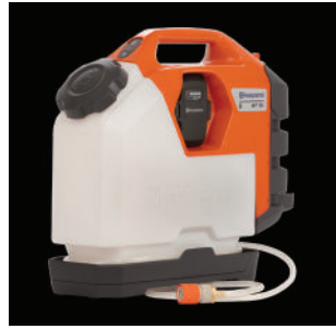
HUSQVARNA WT 15I 599 58 23-04