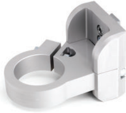
RING ADAPTER 581 25 71-01