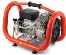
HUSQVARNA VP 200 544 92 90-01