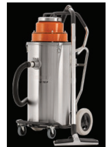
HUSQVARNA W 70 P 967 66 47-04