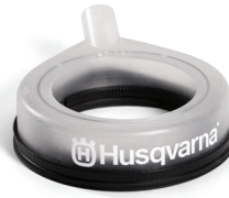
SLURRY RINGS WSR 593 56 30-04