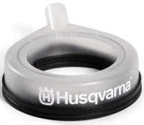
SLURRY RINGS WSR 593 56 30-01