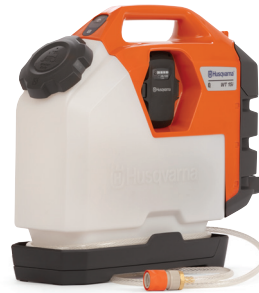
HUSQVARNA WT 15I 599 58 24-07