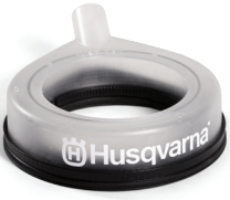
SLURRY RINGS WSR 593 56 30-05