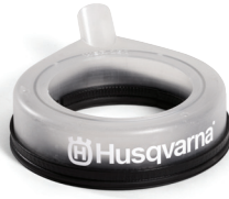
SLURRY RINGS WSR 593 56 30-06