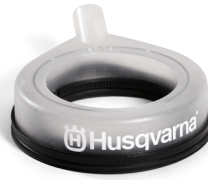
SLURRY RINGS WSR 593 56 30-03