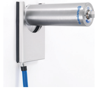
SLURRY COLLECTOR 531 28 03-29