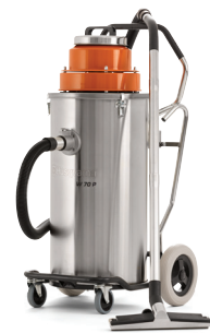
HUSQVARNA W 70 P 967 66 47-06