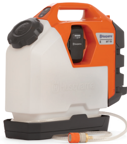
HUSQVARNA WT 15I 599 58 23-02