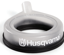
SLURRY RINGS WSR 593 56 30-02