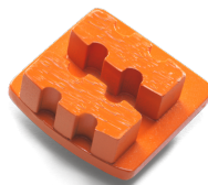
G1410 3 PCS