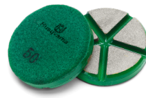
CP 1200 series