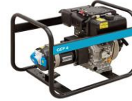
Genset image for illustration purposes only