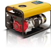
Genset image for illustration purposes only