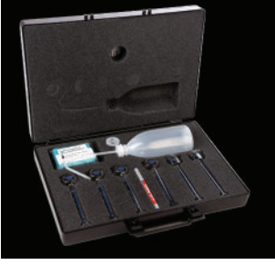
PENETRATION TEST KARSTEN PIPE TEST KIT 598 85 80-02