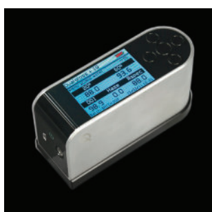
GLOSS & DOI METER RHOPOINT IQ 593 31 15-01