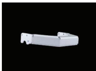
FRONT SUPPORT 533 86 77-02