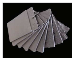
ICRI PROFILE PLASTIC CHIPSET 546 21 69-02