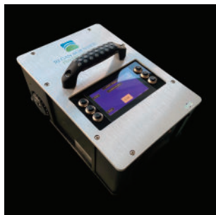
FRICTION TESTER BOT 3000E 531 18 50-01