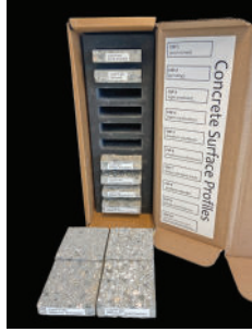
ICRI PROFILE CONCRETE SET 546 21 69-01