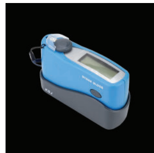
GLOSS METER MG6-SS 593 31 32-01