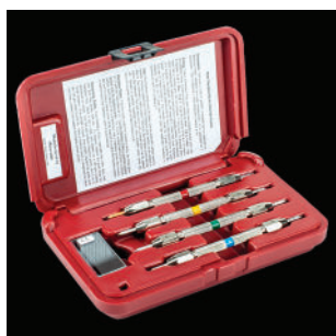
HARDNESS TEST MOH'S TEST KIT 593 31 69-01