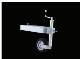
FRONT WHEEL 533 36 87-01