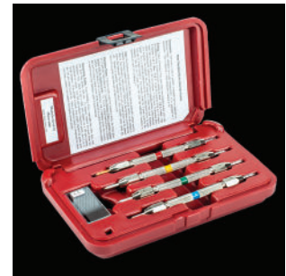
HARDNESS TEST MOH'S TEST KIT 593 31 69-01