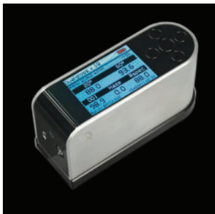
GLOSS & DOI METER RHOPPOINT IQ 593 31 15-01