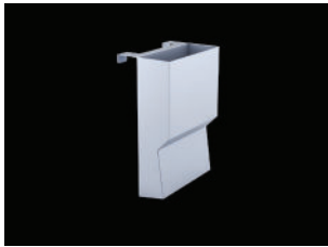
WATER TANK 533 40 61-01