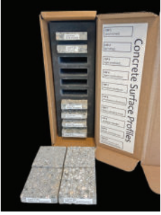
ICRI PROFILE CONCRETE SET 546 21 69-01