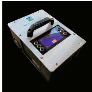
FRICTION TESTER BOT 3000E 531 18 50-01