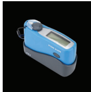
GLOSS METER MG6-SS 593 31 32-01