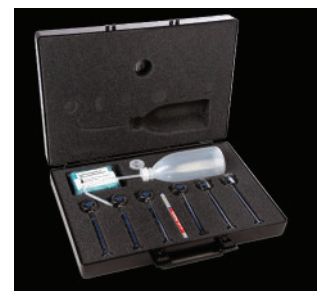
PENETRATION TEST KARSTEN PIPE TEST KIT 598 85 80-02