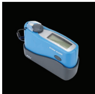
GLOSS METER MG6-SS 593 31 32-01