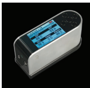
GLOSS & DOI METER RHOPPOINT IQ 593 31 15-01