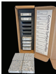
ICRI PROFILE CONCRETE SET 546 21 69-01