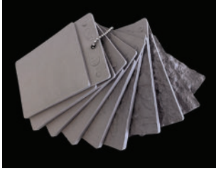
ICRI PROFILE PLASTIC CHIPSET 546 21 69-02