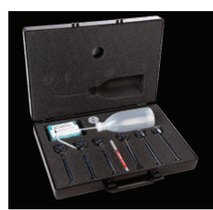
PENETRATION TEST KARSTEN PIPE TEST KIT 598 85 80-02