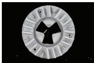
HUSQVARNA TOOL HOLDER AIRFLOW 593 31 93-02