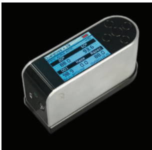
GLOSS & DOI METER RHOPOINT IQ 593 31 15-01