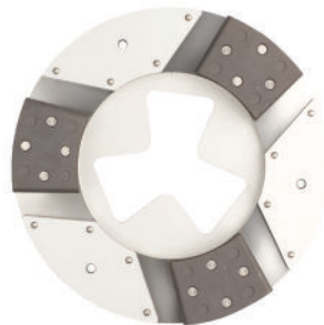
HUSQVARNA TOOL HOLDER ELASTIC/FLEXIBLE 593 31 92-02