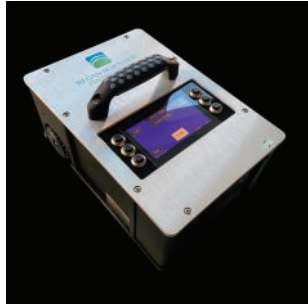
FRICTION TESTER BOT 3000E 531 18 50-01