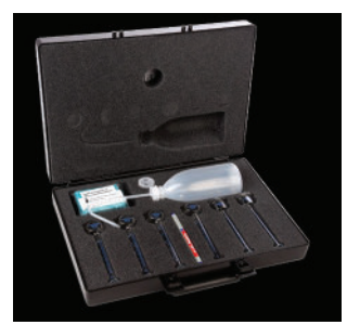
PENETRATION TEST KARSTEN PIPE TEST KIT 598 85 80-02