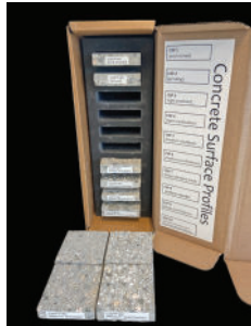
ICRI PROFILE CONCRETE SET 546 21 69-01