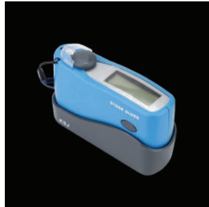
GLOSS METER MG6-SS 593 31 32-01