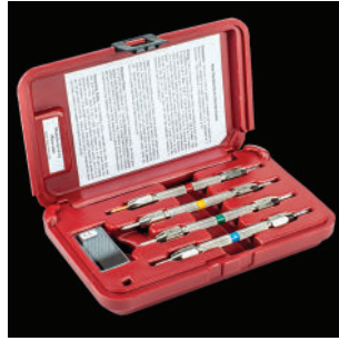
HARDNESS TEST MOH'S TEST KIT 593 31 69-01