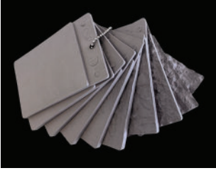
ICRI PROFILE PLASTIC CHIPSET 546 21 69-02