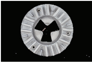
HUSQVARNA TOOL HOLDER AIRFLOW 593 31 93-02