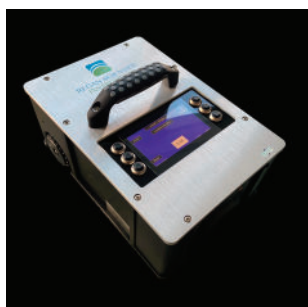
FRICTION TESTER BOT 3000E 531 18 50-01