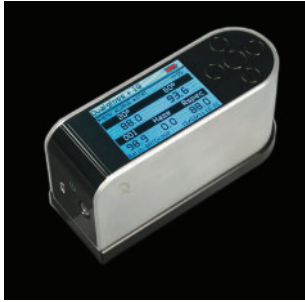
GLOSS & DOI METER RHOPPOINT IQ 593 31 15-01