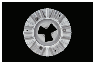
HUSQVARNA TOOL HOLDER AIRFLOW 593 31 93-01