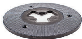
HUSQVARNA RESIN HOLDER 593 31 48-03