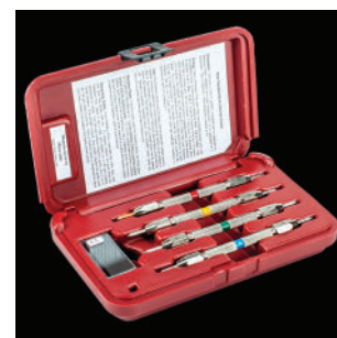
HARDNESS TEST MOH'S TEST KIT 593 31 69-01