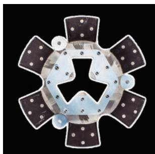
HUSQVARNA TOOL HOLDER ELASTIC/FLEXIBLE 593 31 94-01