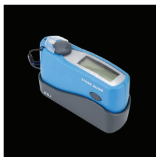
GLOSS METER MG6-SS 593 31 32-01