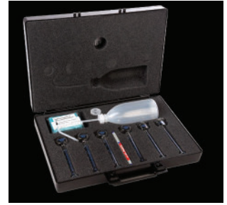
PENETRATION TEST KARSTEN PIPE TEST KIT 598 85 80-02