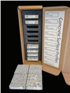
ICRI PROFILE CONCRETE SET 546 21 69-01