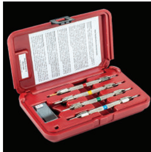
HARDNESS TEST MOH'S TEST KIT 593 31 69-01