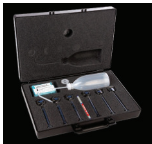
PENETRATION TEST KARSTEN PIPE TEST KIT 598 85 80-02