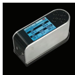
GLOSS & DOI METER RHOPOINT IQ 593 31 15-01