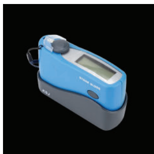
GLOSS METER MG6-SS 593 31 32-01