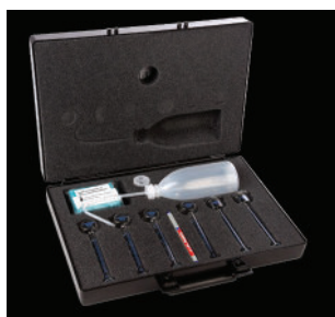
PENETRATION TEST KARSTEN PIPE TEST KIT 598 85 80-02