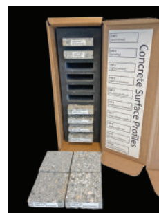
ICRI PROFILE CONCRETE SET 546 21 69-01