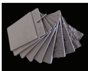
ICRI PROFILE PLASTIC CHIPSET 546 21 69-02