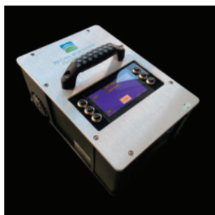
FRICTION TESTER BOT 3000E 531 18 50-01