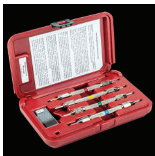
HARDNESS TEST MOH'S TEST KIT 593 31 69-01