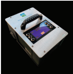
FRICITION TESTER BOT 3000E 531 18 50-01