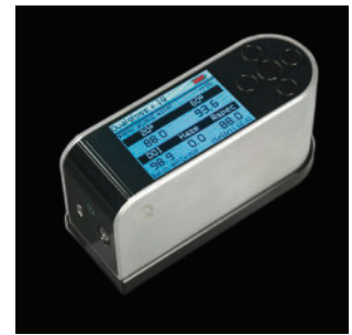
GLOSS & DOI METER RHOPOINT IQ 593 31 15-01