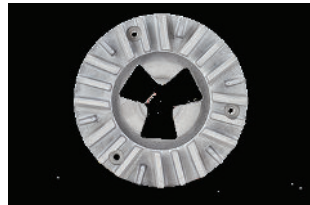
HUSQVARNA TOOL HOLDER AIRFLOW 593 31 93-02