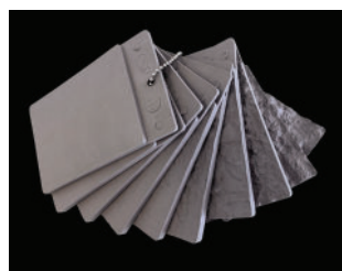
ICRI PROFILE PLASTIC CHIPSET 546 21 69-02