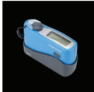
GLOSS METER MG6-SS 593 31 32-01