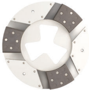
HUSQVARNA TOOL HOLDER ELASTIC/FLEXIBLE 593 31 92-02