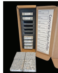
ICRI PROFILE CONCRETE SET 546 21 69-01