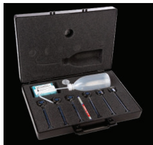
PENETRATION TEST KARSTEN PIPE TEST KIT 598 85 80-02