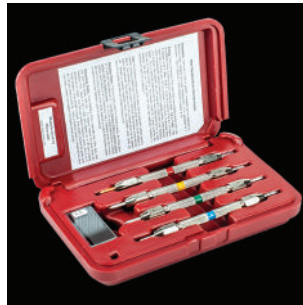
HARDNESS TEST MOH'S TEST KIT 593 31 69-01