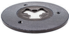
HUSQVARNA RESIN HOLDER 593 31 48-02