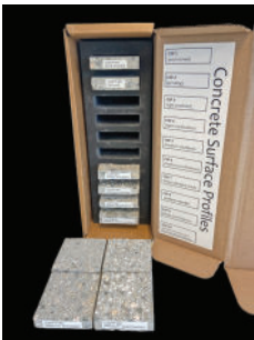
ICRI PROFILE CONCRETE SET 546 21 69-01