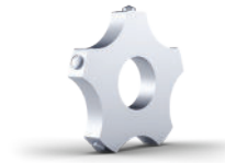
WHEEL CUTTERS 534 42 04-01