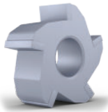
WHEEL CUTTERS 534 70 61-01