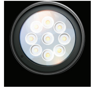
LED LIGHT SET 534 66 77-01