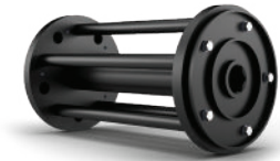
DRUM WITH SHAFTS 533 87 36-01