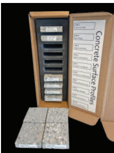
ICRI PROFILE CONCRETE SET 546 21 69-01