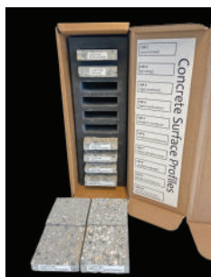
ICRI PROFILE CONCRETE SET 546 21 69-01