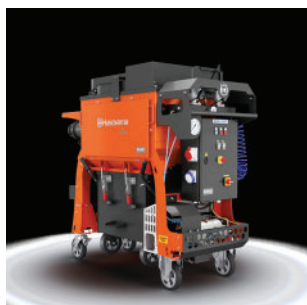
HUSQVARNA BLASTRAC DC 655 970 68 52-01