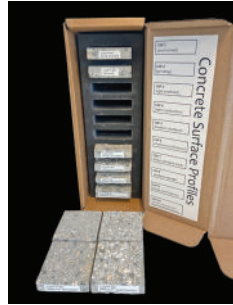
ICRI PROFILE CONCRETE SET 546 21 69-01