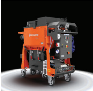
HUSQVARNA BLASTRAC DC 655 970 68 52-01