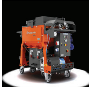
HUSQVARNA BLASTRAC DC 975 970 70 52-03