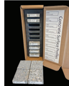
ICRI PROFILE CONCRETE SET 546 21 69-01