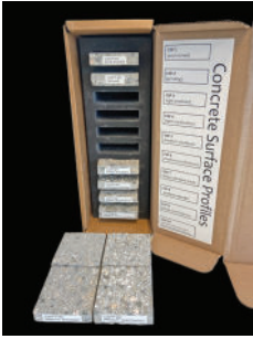
ICRI PROFILE CONCRETE SET 546 21 69-01