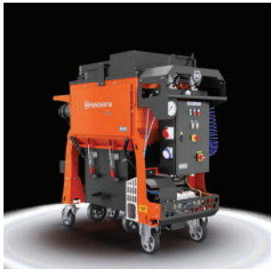
HUSQVARNA BLASTRAC DC 655 970 68 52-01