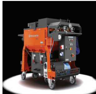
HUSQVARNA BLASTRAC DC 975 970 70 52-03