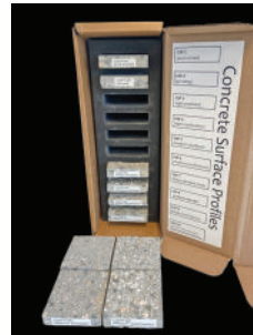
ICRI PROFILE CONCRETE SET 546 21 69-01